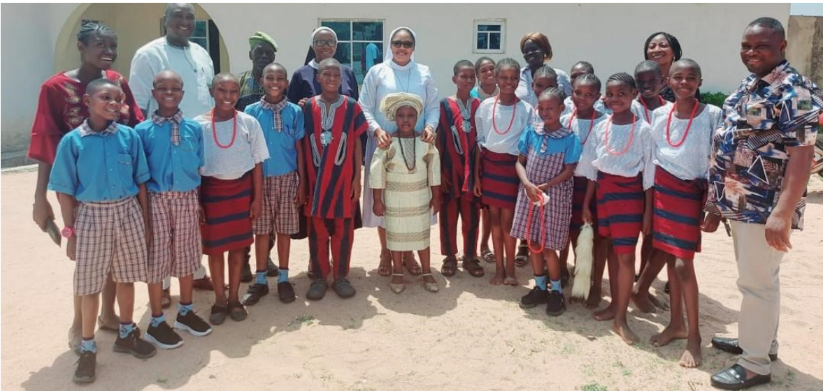
Long live Michaelian Catholic Schools Isanlu!