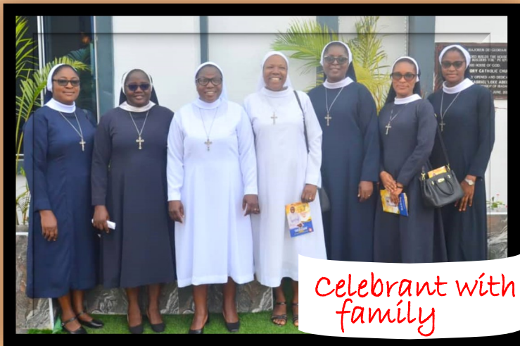
Celebrant with her religious family