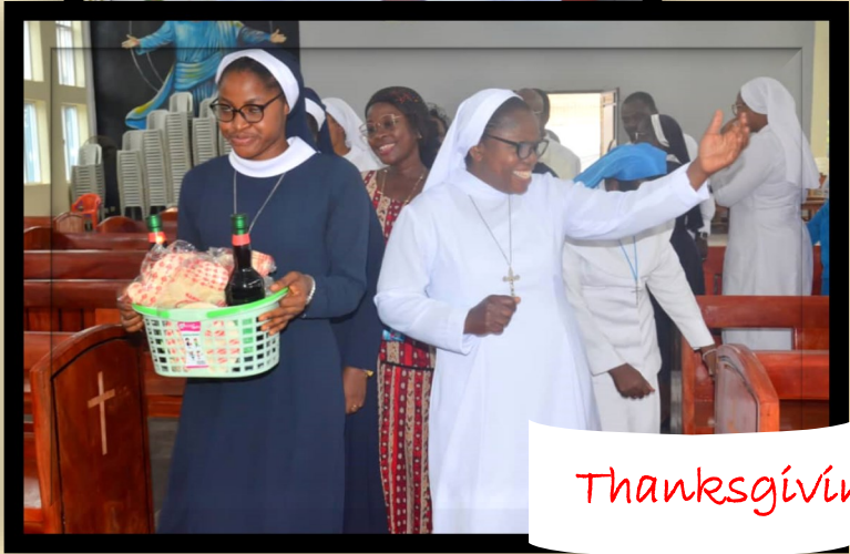
Thanksgiving at Mass