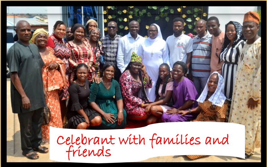
Celebrant with families and friends