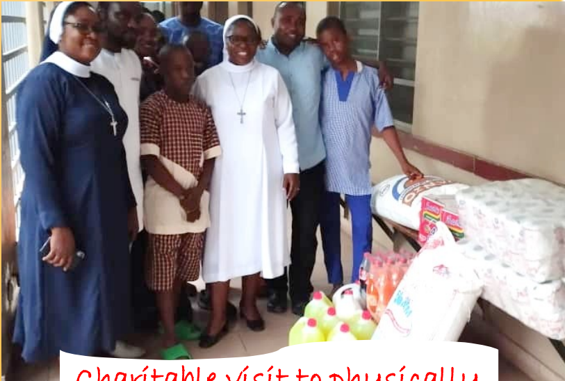
Charitable visit to physically challenged children