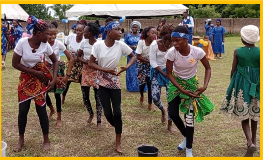
Long live the SSMA Isanlu Community!!